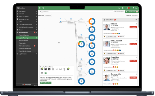
Intuitive easy to use view into the network and endpoint vulnerabilities