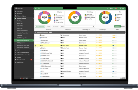
Visibility with FOS Application Signatures