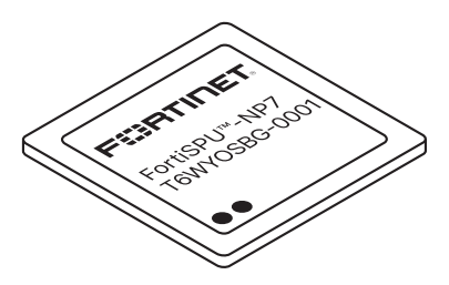
Network Processor 7 NP7

Network Processors operate inline to deliver unmatched performance and scalability for critical network functions. Fortinet's breakthrough SPU NP7 network processor works in line with FortiOS functions to deliver: