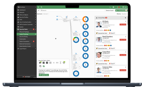
Intuitive easy to use view into the network and endpoint vulnerabilities